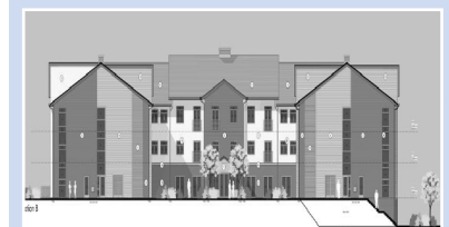
Shown from the Courtyard