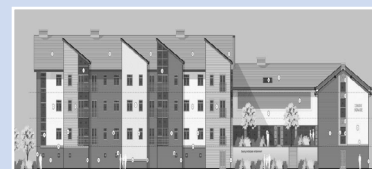
Showing the Medical Centre on the right.